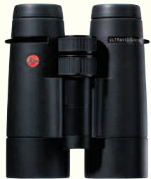
LEICA ULTRAVID 8 x 42 HD

The models of binocular and spotting scopes with the new HD and APO lenses are now fitted with Leica AquaDura™, a “hydrophobic coating” which with its water and dirt-repelling properties, ensures clear visibility even in poor weather conditions. As with the leaves of the lotus plant, droplets of rain simply roll off the lens, and fingerprints and dirt particles are much easier to remove. In addition, thanks to its increased abrasion resistance, Leica AquaDura™ will protect your valuable lenses from damage even more effectively.