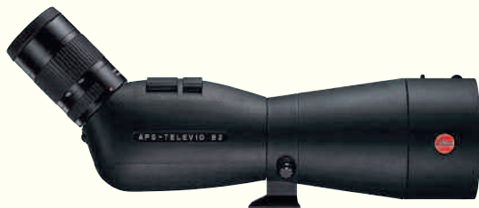
LEICA APO-TELEVID 82 angled